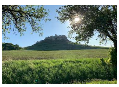
DAY 6 RELAXING DAY – LEVOCA TOWN and SPISS CASTLE / UNESCO SIGHTS

Today, a relaxing day, meeting at 9am. We'll hike down to Hrebienok, take a funicular to Stary Smokovec and drive to Strbske Pleso