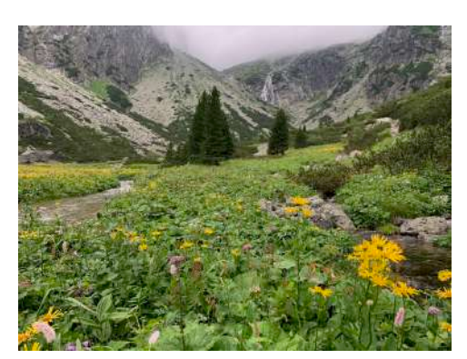
DAY 4 TERYHO CHATA MOUNTAIN HUT (2015 m)

Breakfast at 8am, briefing, departure at 8:45am and let's hike up to Teryho chata, located in the upper part of Mala Studena dolina / valley and surrounded by rocky peaks. Enjoy the mountains and its views of the peaks and valleys.