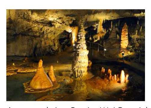
DAY 4 RELAXING DAY

Today, we'll visit the Demanovska Cave of Liberty (tour takes 1 hour, be prepared for 900+ steps). In the afternoon, i tis possible to Relax in Tatralandia Aquapark, the largest water fun complex in Slovakia situated in a beautiful Liptov region.