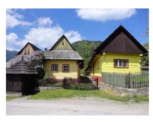
DAY 2 HRONSEK WOODEN CHURCH & LEVOCA TOWN / UNESCO

We'll drive to see a hidden jewel, the wooden articular church Hronsek . Afterward, we'll drive through the mountain pass Donovaly and enter the mountain village of Vlkolinec , a remarkably intact settlement with the traditional features of a central European village. It is the region's most complete group of these kinds of traditional log houses, often found in mountainous areas. Great opportunity to try samples of honey wine (mead), from local winemakers. Go back in time and see how people used to live two centuries ago. Visit a