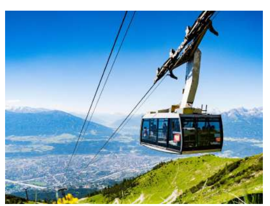
DAY 7 INNSBRUCK – EASY HIKING TOUR

We'll take a Nordketten Cable Car and within 20minutes will be in 2000mASL above the city. Walk up to the highest point and enjoy the stunning views from the top.