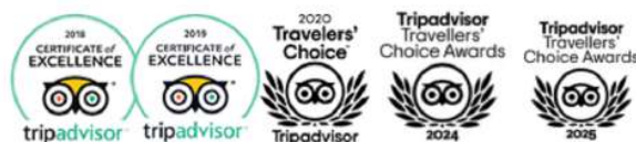
Tripadvisor's Certificate of Excellence Awards

Read about us on the world's largest travel site – on Tripadvisor. Best Slovakia Tours is dedicated to the best service quality and this is reflected year after year when TripAdvisor awards us with their Certificate of Excellence.